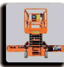
Swing Out Tray