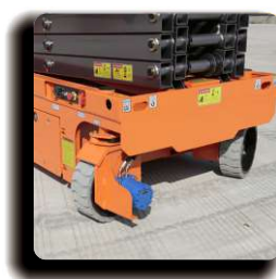
Compact Turning Radius